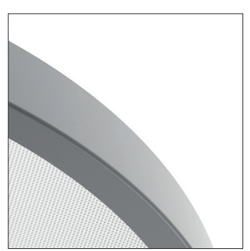
MP19H microprismatic diffusor