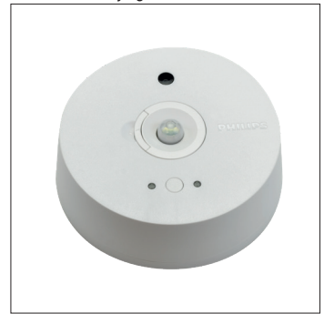
{\tt MCS\ wireless\ daylight\&occ\ sensor}