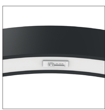
XC daylight&occ sensor

All current index numbers, lumen outputs, power consumption and many other technical information are available in our 2024 pricelist. Details on wireless lighting control systems on page number 896.